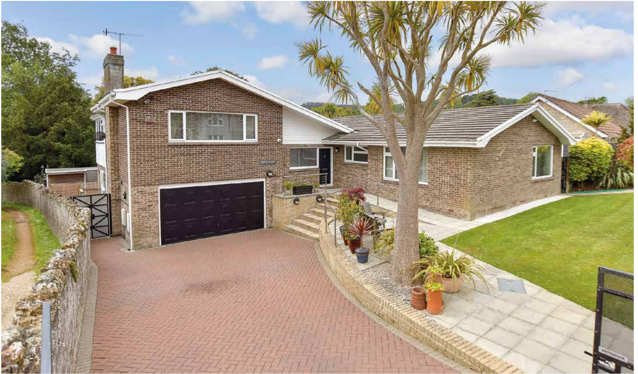
Fiddlers Green 6 Paddock Road | Shanklin | Isle of Wight | PO37 6NZ