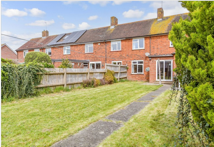
Ground Floor Approx. 57.8 sq. metres (622.5 sq. feet)