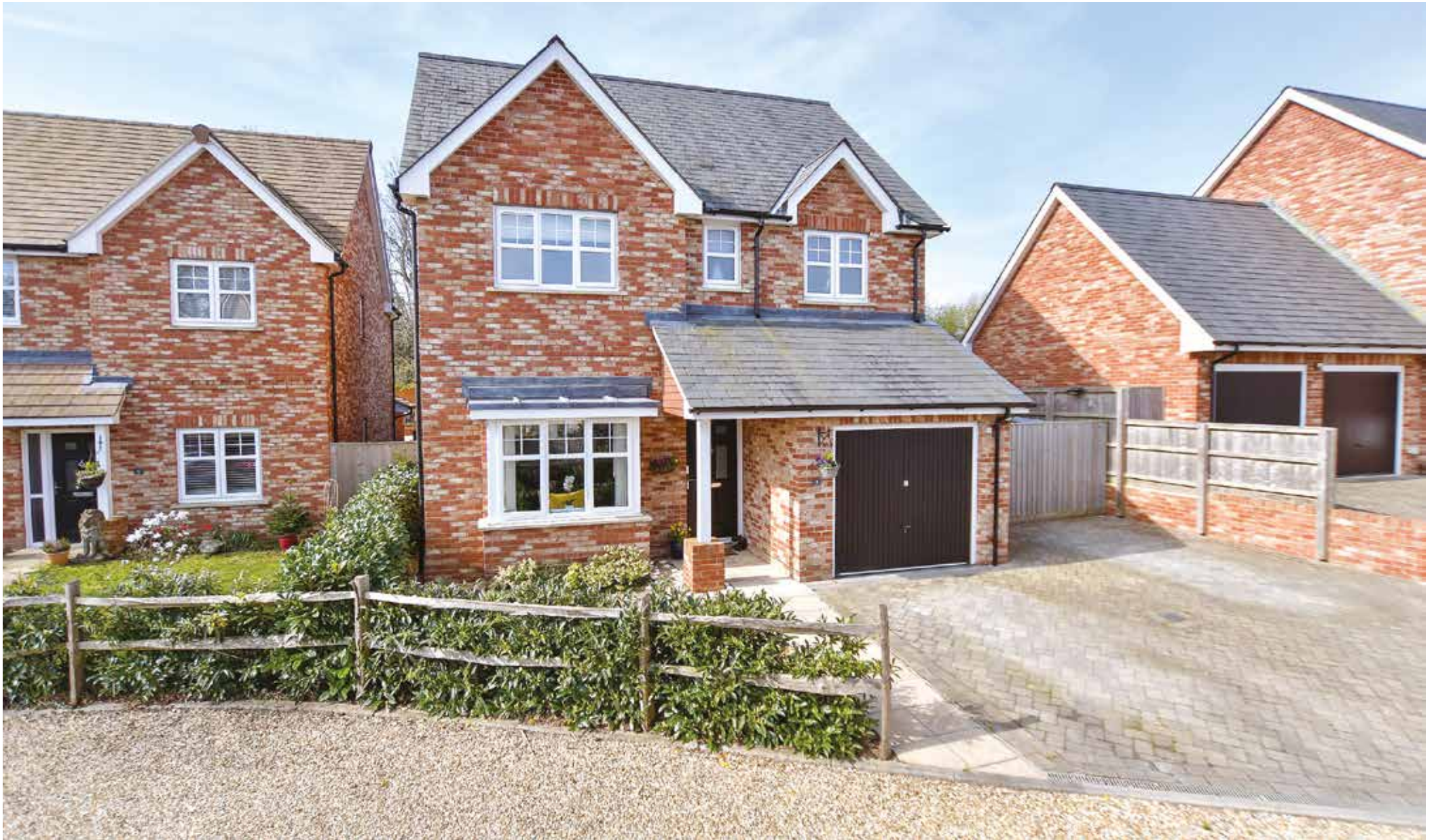
4 Hollybush Close Ryde | Isle of Wight | PO33 1GG