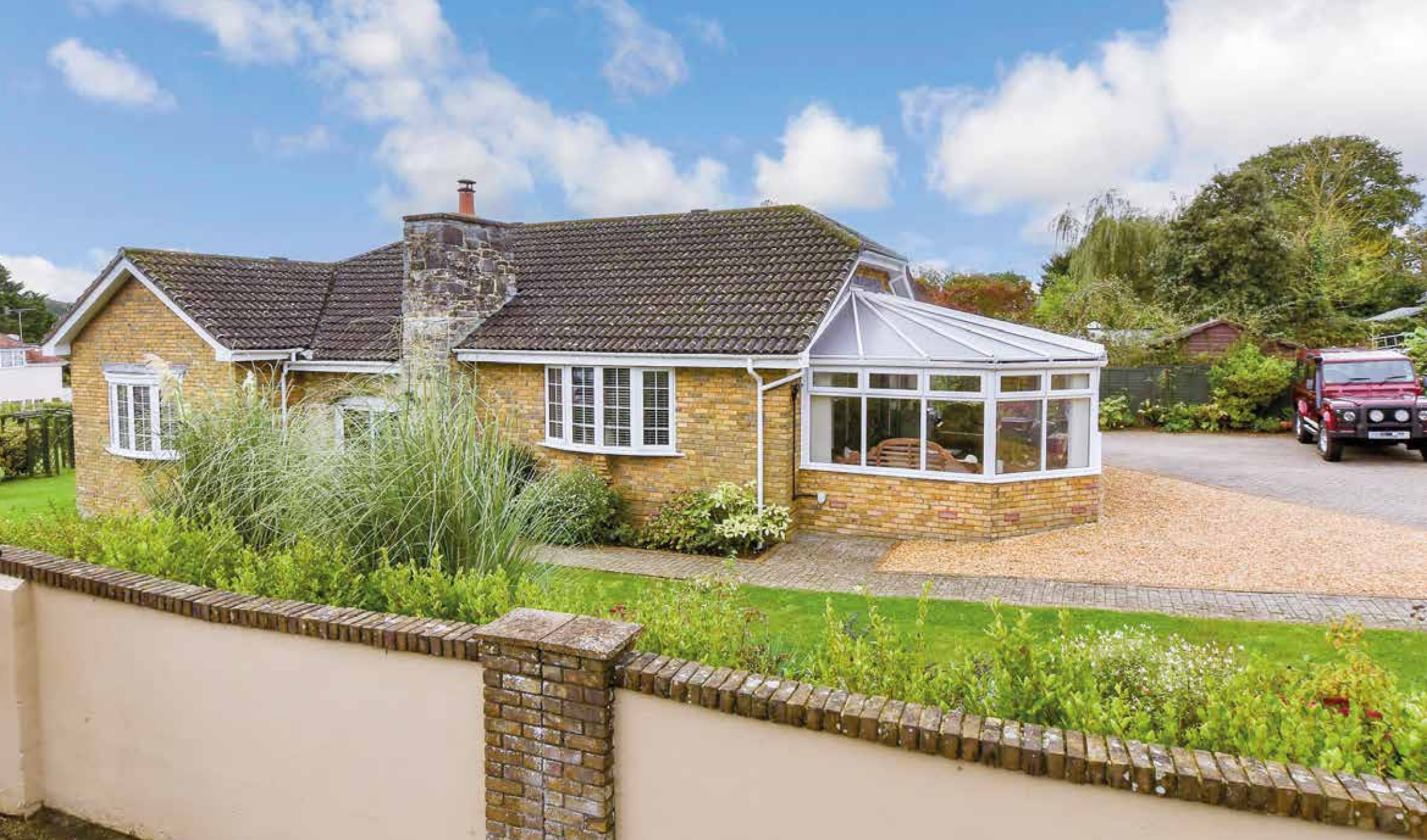
Chris Cottage Quarr Hill | Binstead | Isle of Wight | PO33 4EH