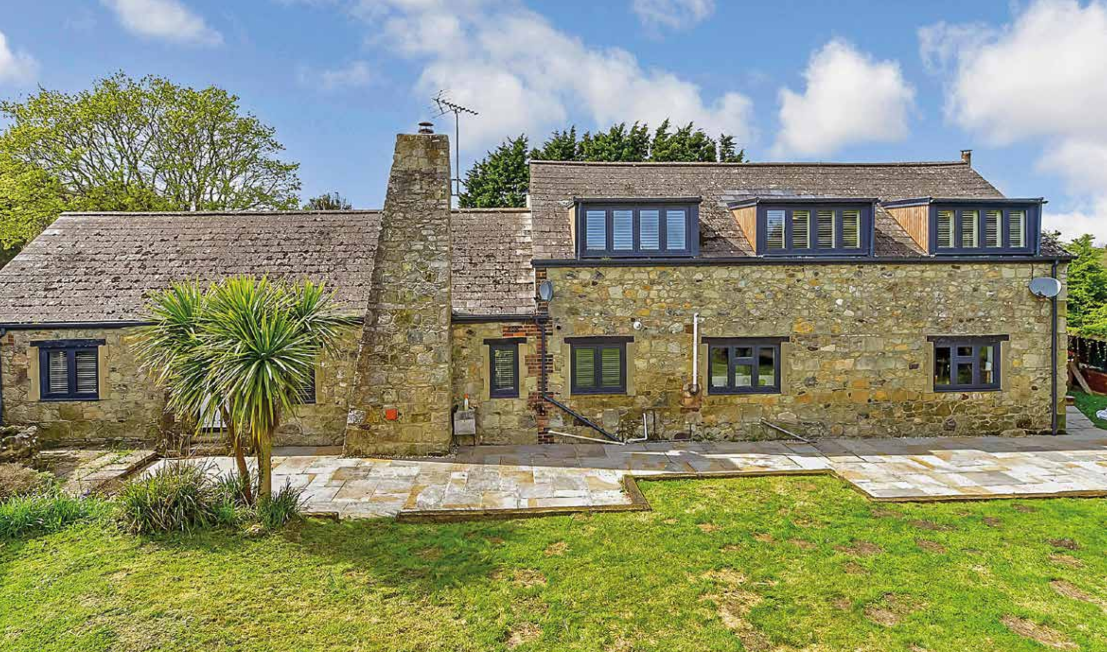
The Old Barn Canteen Road | Whiteley Bank | Ventnor | Isle of Wight | PO38 3AF