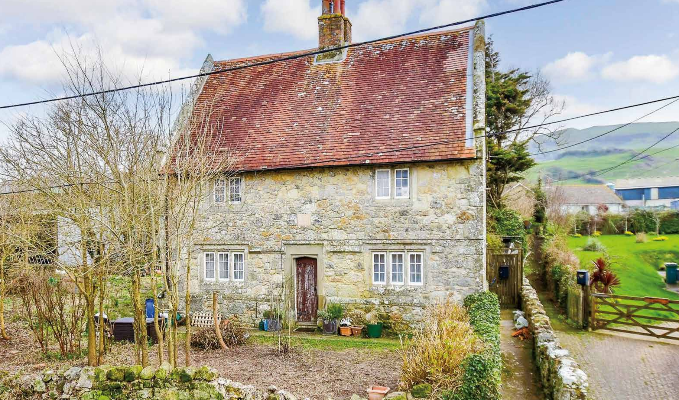
Lower House Church Place | Chale | Ventnor | Isle of Wight | PO38 2HB