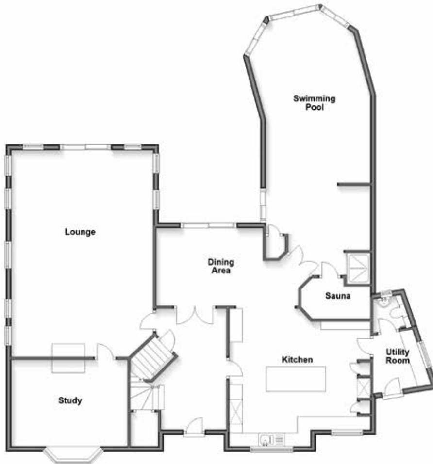
Ground Floor Approx. 163.9 sq. metres (1753.8 sq. feet)