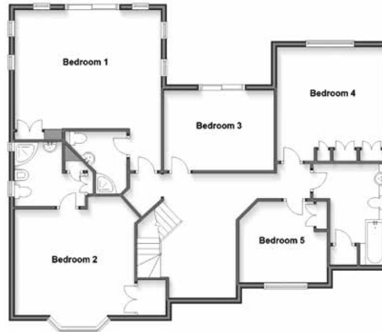
First Floor Approx. 126.0 sq. metres (1356.3 sq. feet)

Front Garden Double Garage Car Port Rear Garden Summer House