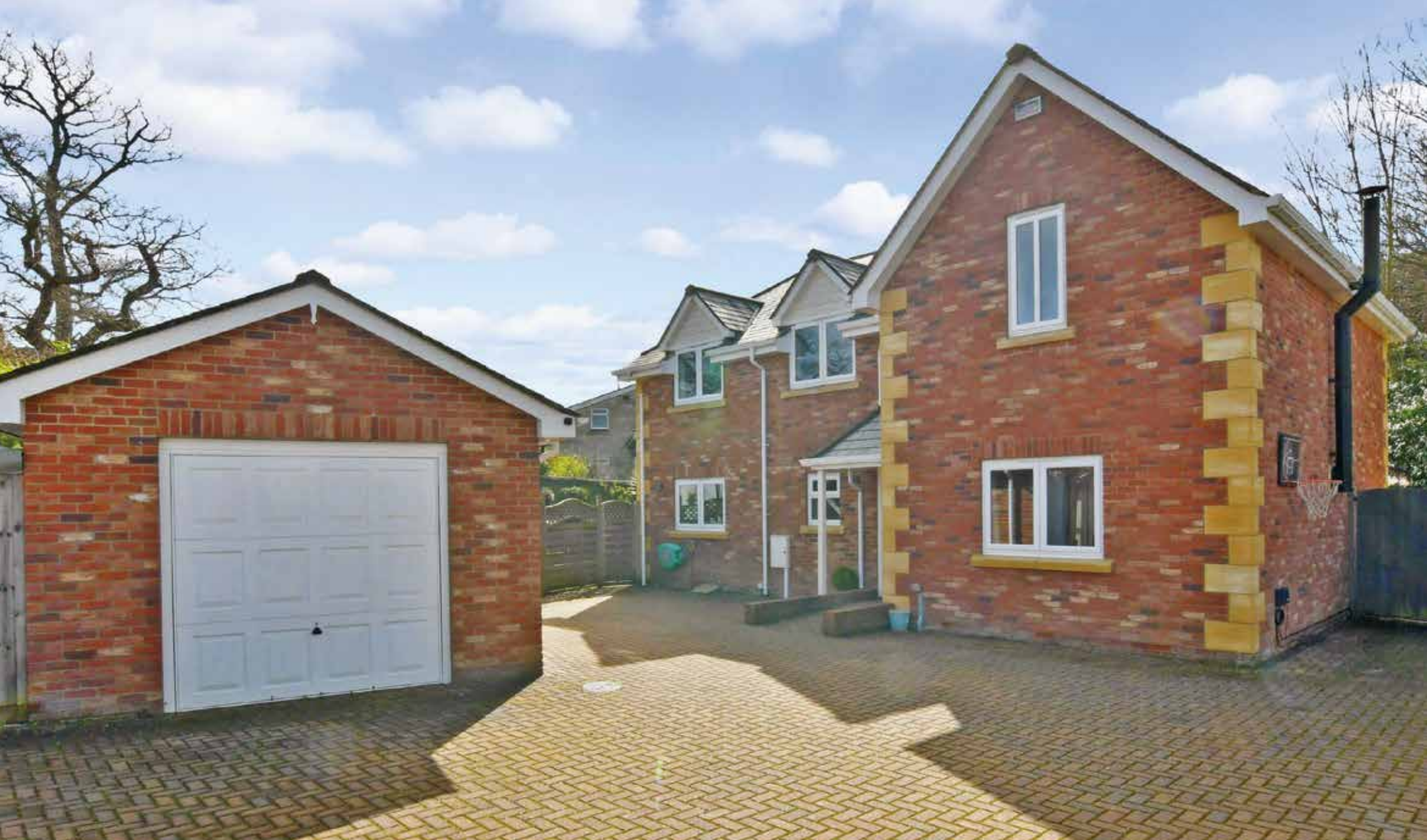
Maple Tree House 9a Northwood Drive | Ryde | Isle of Wight | PO33 3AQ