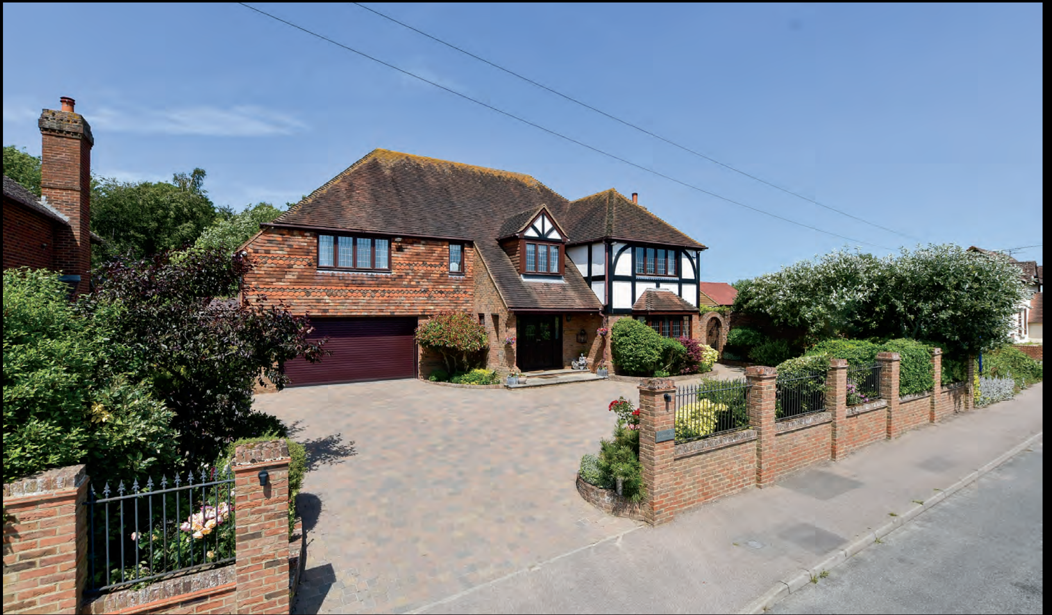
Aashirwad Monkton Road | Minster | Ramsgate | Kent | CT12 4EF